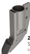
2345-4 Side Band OEM AA71412