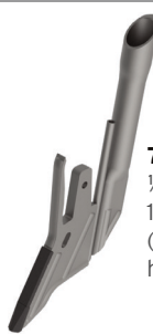
7808 ¼" Liquid OD 1 ¼" Granular (Can fit multiple hose sizes).