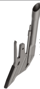
2350 ¼" Liquid ID 1 ¼" Granular