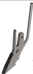
2313 ½" NH3 For Tru-Kare Also Order OEM AA69276 2338 Bushing