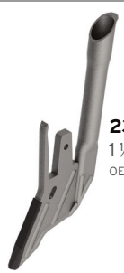
2330 1 ¼" Granular OEM AA86117